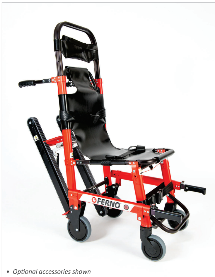
• Optional accessories shown